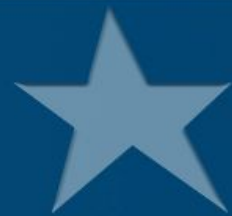
Price / Tangible Book Value